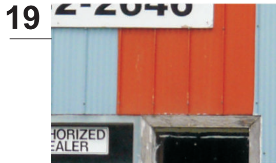
19. Hwy #244 - Curry Bros Ltd. (Vacant building)