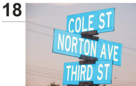
18. Miami Street sign