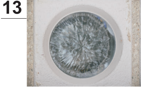
13. Somerset Food Bar -306 3rd St