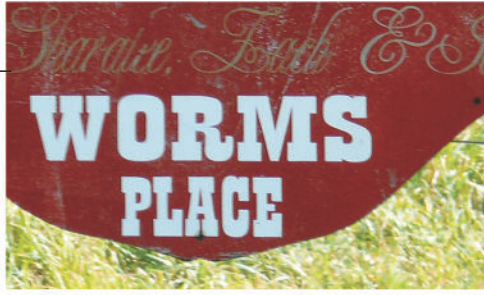
24. Hwy #31 - Red Dog Ranch