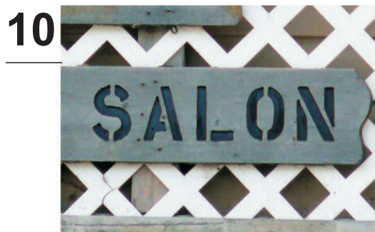
10. Morden - Zantana's Hair Salon - 101-723 Thornhill St.