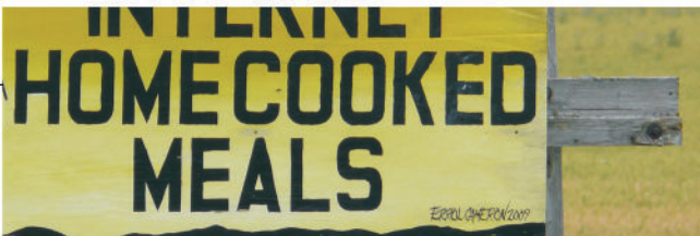
27. Hwy #23 Sign - Somerset to Manitou