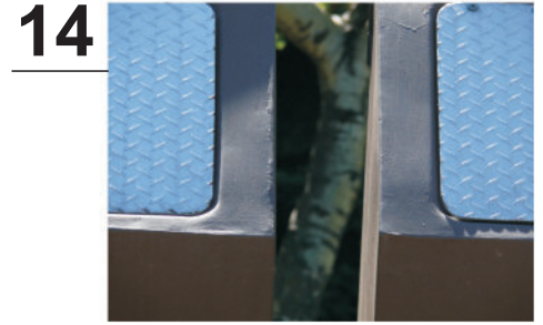
14. Pembina Valley Provincial Park - Parking Lot Garbage Cans