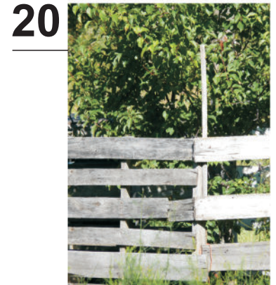
20. A Rocha - off of 201 near Pembina Valley Provincial Park