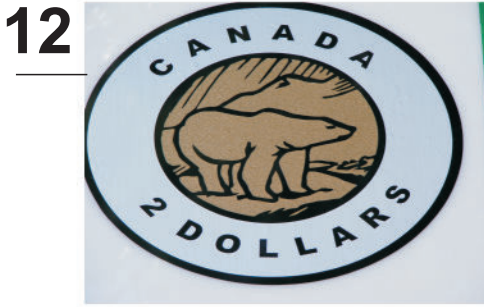
12. Carman - Prices Rite Dollar Store - 18 1st St SW