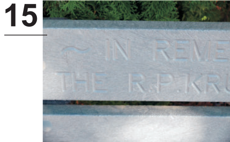
15. Morden - Street bench in front of Fields (Store Closed) - 363 Stephen St.