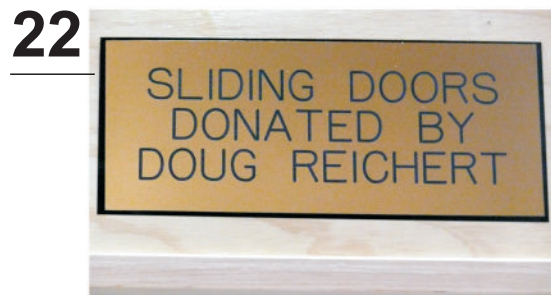
22. Morden Community Centre - Manitoba Baseball Hall of Fame - 111 Gilmour St.