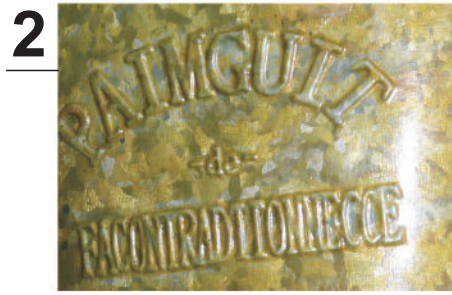
2. Somerset Gift Shop Boutique 277 Carlton Ave. (pail in shop)