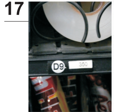
17. Morden Community Centre (vending machine) - 111 Gilmour St.