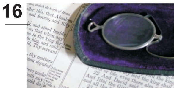
16. Manitou Log House Tourism Centre - Corner of Hwy #3 & Main St.