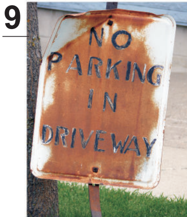
9. Manitou - 311 Main St.