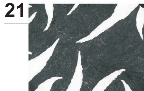
21. Somerset - 308 3rd St. (painted rock in front garden)