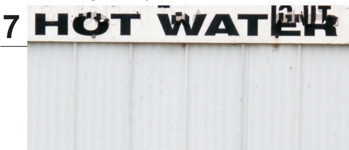
7. Manitou Romax Auto Car Wash Sign - Hwy #3