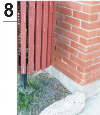
8. Morden - 274 Stephen St. - BSI Insurance