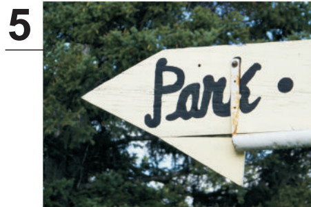
5. Miami Campground Hwy #23