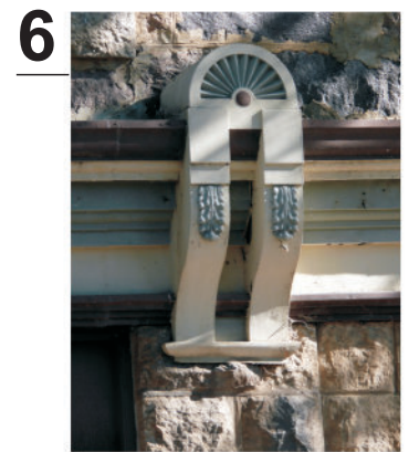
6. Morden 351 Stephen St. - Manitoba Land Titles Office