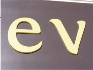
25. Carman - Evensong - 82 Main St.