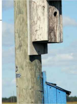
26. Off Hwy #201 road to A Rocha & Pembina Valley Provincial Park