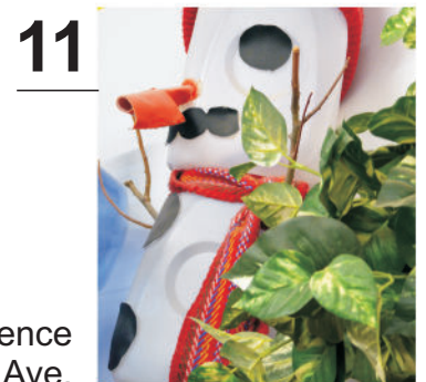
11. Somerset Crossroads Convenience - 272 Carlton Ave.