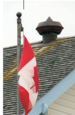
28. Manitou Opera House - 325 Main St.